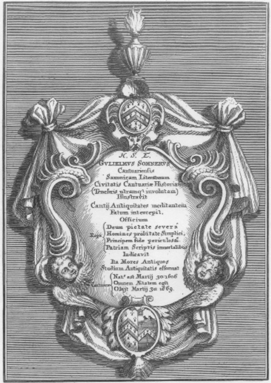
Fig. 4 Somner's monumental inscription in St Margaret's church, Canterbury. It reads: 'Here lies William Somner of Canterbury who elucidated the Saxon language and the history of Canterbury, both of which were obscured in darkness. Death interrupted him planning his Kentish Antiquities. He showed his duty to God with strict piety, to men by a simple honesty, to the king by a hazardous allegiance, and to his country in his immortal writings. Thus the study of antiquity moulded ancient customs. He was born 30 March 1606, spent his whole life in Canterbury, and died 30 March 1669'.